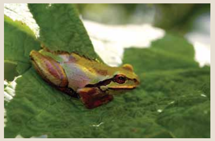
Pacific Chorus Frog.

upheld. Clearly, a sustainable stewardship program is a priority.