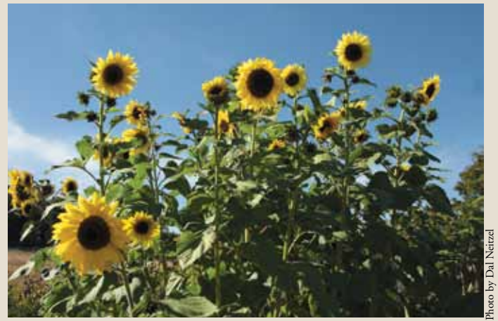
Lemon Queen sunflowers attract pollinator bees at community garden.

At the Curry Preserve, enthusiastic volunteers prune the old apple orchard, clear blackberries, and maintain walking trails for humans, horses and dogs on leashes. Small-scale farming at the community garden project helps people learn about organic gardening and sustainable food production. Several volunteer